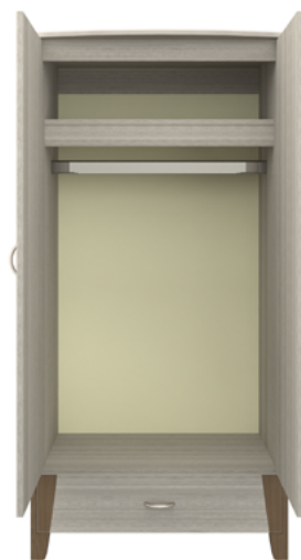
Model: LBWR12 34.75W 23D 71H

Refreshing as the sea air its name represents, the streamlined Long Beach Collection's dual-toned look is the perfect match for any décor. Long Beach features chamfered side frames and front overlay design; extended tops provide additional space. The distinctive leg design has stylish dimensional appeal. The product is required to be wall mounted for safety. Using the kit provided, please follow provided instructions exactly.